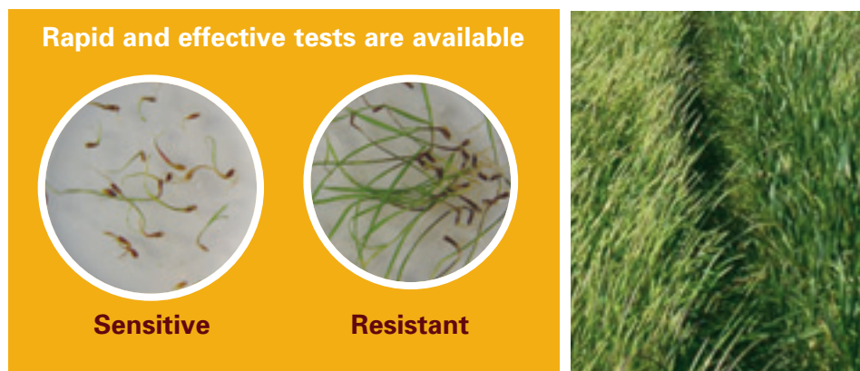
A serious case of ALS Target site resistant black-grass

Early detection is very important. Rapid and effective tests are now available to help distinguish between the three forms of resistance. Resistance varies between fields and farms, so having seed samples tested can help you identify how extensive the problem is across your farm.