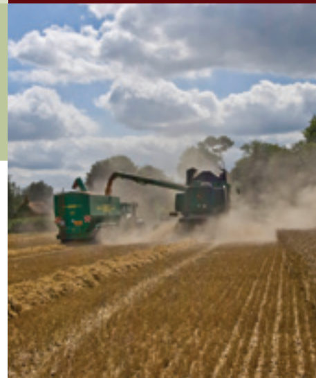
Ensure combines are cleaned between fields to avoid spreading infestations.