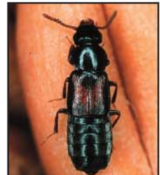
ROVE BEETLE Staphylinidae