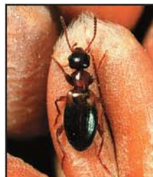
NARROW-NECKED HARVEST BEETLE Anthicus floralis