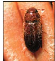
HAIRY FUNGUS BEETLE Typhaea stercorea