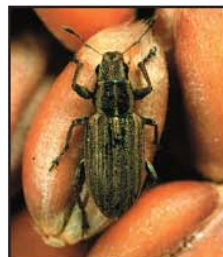
CLOVER WEEVIL Sitona species