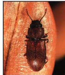
FOREIGN GRAIN BEETLE Ahasverus advena