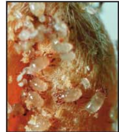
FLOUR MITE Acarus siro