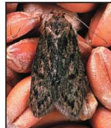
BROWN HOUSE MOTH Hofmannophila pseudospretella