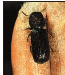
LESSER GRAIN BORER Rhyzopertha dominica