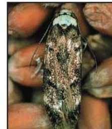
WHITE-SHOULDERED HOUSE MOTH Endrosis sarcitrella