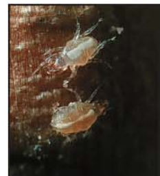
PREDATORY MITE Cheyletus eruditus