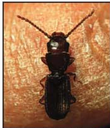
RUST-RED GRAIN BEETLE Cryptolestes ferrugineus