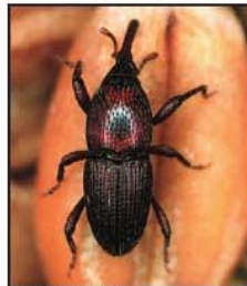
GRAIN WEEVIL Sitophilus granarius