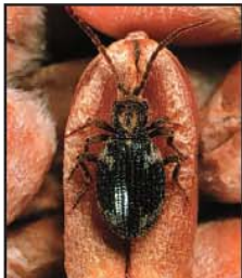
WHITE-MARKED SPIDER BEETLE Ptinus fur