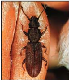
SAW-TOOTHED GRAIN BEETLE Oryzaephilus surinamensis

These are the more common of over 50 species that may occur in grain stores. Correct identification is important. For advice and an identification service please contact The Food and Environment Research Agency using the details given below.