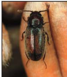
MOULD BEETLE Cryptophagus species