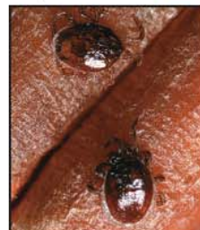
PREDATORY MITE Gamasina