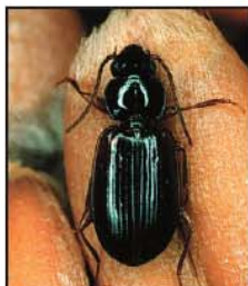
GROUND BEETLE Carabidae