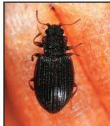
PLASTER BEETLE Lathrididae