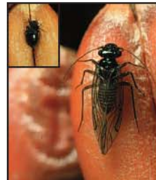
BOOKLICE (2 species shown) Psocoptera